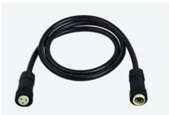
LC (Link Cable)**

6IN-LC (6 in) 1M-LC (1 Meter) 2M-LC (2 Meter)