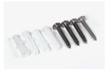
Mounting Screws included